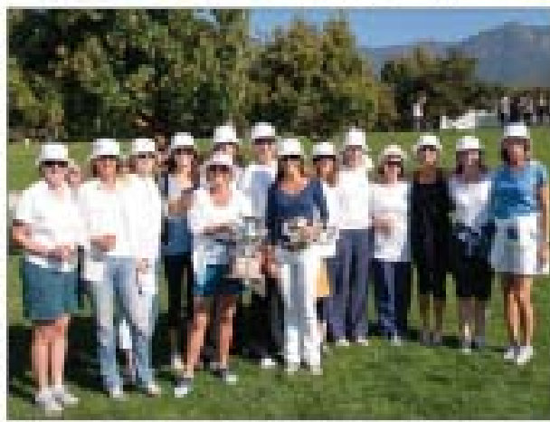
Volunteers and donors at the 5K run. The event was a success, with more than 800 people participating and raising over $10,000 for cancer research.

The foundation's goal is to fund research that will lead to a cure for cancer. The 5K run was one of the many events held during the foundation's annual fundraising campaign. The event was a success, with more than 800 people participating and raising over $10,000 for cancer research. The foundation's executive director, Dr. [Name], said that the event was a testament to the community's support for cancer research. He said that the foundation is grateful for the many volunteers and donors who have helped to make the event a success. The foundation's website is www.santabarbaracancer.org .