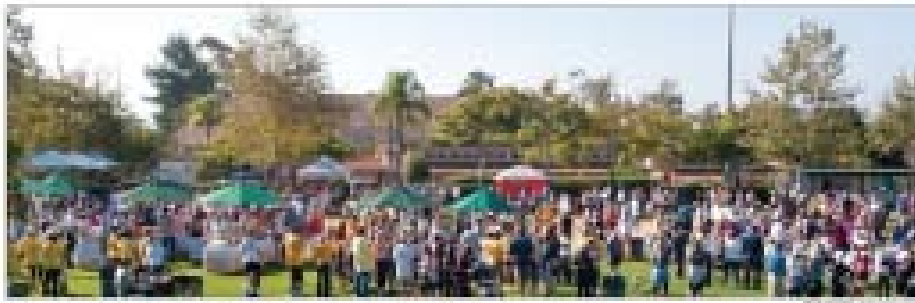
At the past, thousands of people gathered for a charity event with the goal of raising money for cancer research.