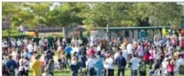
Local businesses, community organizations, groups of families and friends formed teams of five or more to participate and fundraise at the 19th annual Cancer Center Walk/Run.

Participants in the Cancer Center of Santa Barbara's Walk/Run event may move at their own pace, but all chase the same goal