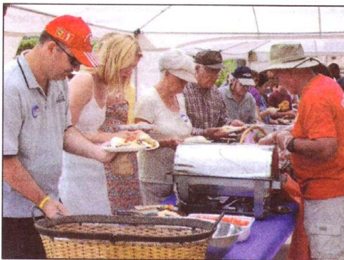
Participants enjoyed lunch and dessert.

The event was open to cancer patients, cancer survivors, and their families and friends. Patients received a gift to remember the day and everyone attending was be treated to a great Mexican food lunch with ice cream and cupcakes to top it off.