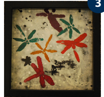
Dragon Flies , Erika Kahn Monoprint, 10" x 10"