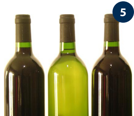
Assortment of local Wines 3 Bottles