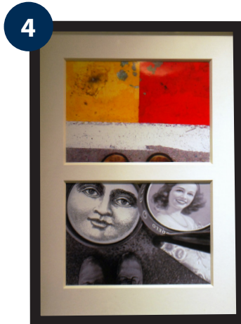
Yellow and Red Stripe / Two Platters , Michael "Fish" Fisher Photographs, 11" x 14"